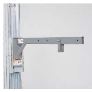
BOOM OPTION transforms your lift into a mobile, vertical crane or hoist to position tooling fixtures, circuit breakers, engines and more.