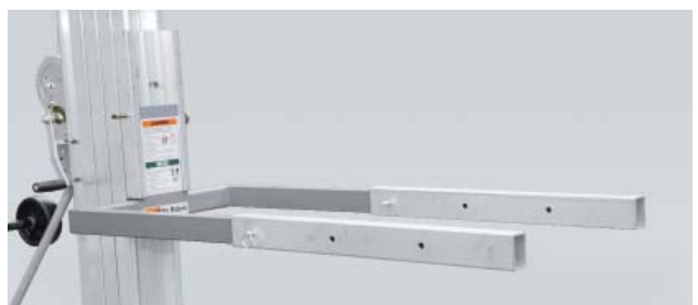
FORK EXTENSIONS insert onto standard forks for an additional 25 in (64 cm) of length.