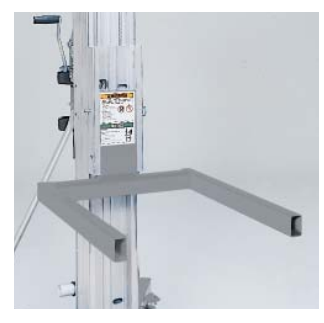
STANDARD FORKS accommodate various loads for versatile lifting. Get an additional 20 in (51 cm) of lift by turning over and re-pinning the forks.

A variety of load handling accessories make this unit extremely versatile.