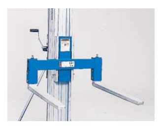
FLAT FORKS, which widen from 16 to 31 in (41 to 79 cm) to provide proper support, allow you to easily lift your load off of flat surfaces.