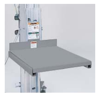
LOAD PLATFORM fits over the forks to handle odd-sized or heavy objects — no tools required for installation.