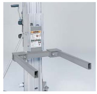
ADJUSTABLE FORKS widen from 11 to 30 in (28 to 76 cm) to accommodate diverse loads.