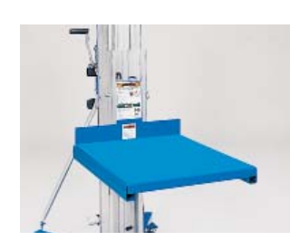
LOAD PLATFORM fits over the forks to handle odd-sized or heavy objects - no tools required for installation.