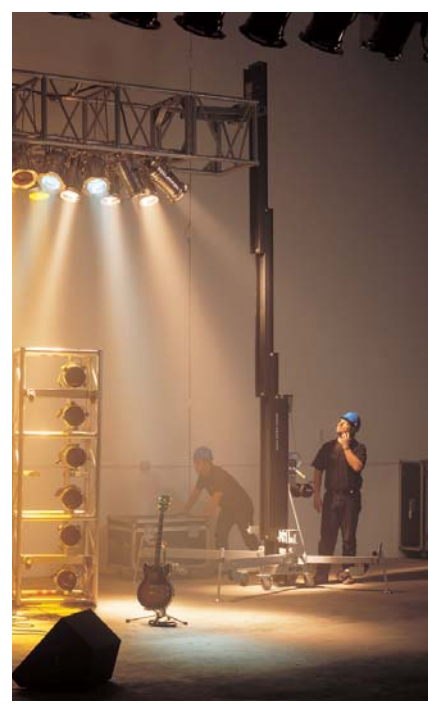
Quick, Simple Setup

The compact stowed position makes the Super Tower lift easy to move through doors and load on trucks with no bulky base to get in the way. Stowed dimensions are 22 in (56 cm) by 25.25 in (64 cm).