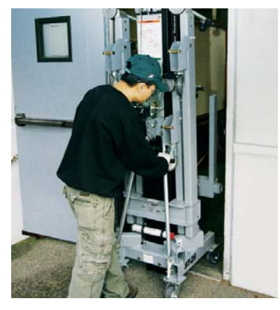
Easy Transport and Storage

Fork extensions insert onto standard forks for an additional 25 in (64 cm) of length.