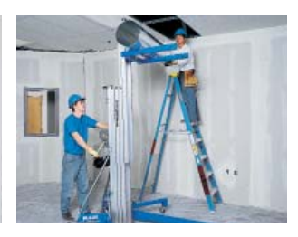
PATENTED TELESCOPING MAST SYSTEM Heavyduty design provides compactness, strength and rigidity.