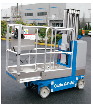
Sliding Mid Rail Extension Deck Platform 55 x 29.5 in (140 x 75 cm) provides 20 in (51 cm) of horizontal outreach and a larger work area within the platform.