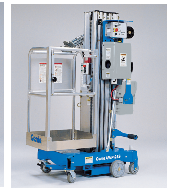
Narrow Platform 26 x 20 in (66 x 51 cm) For access through standard ceiling tile and other small openings.