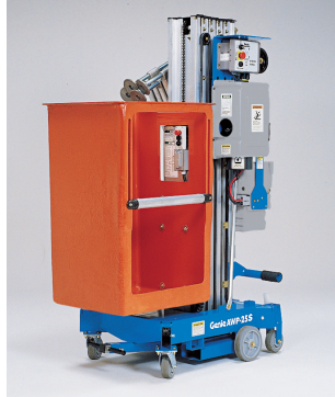
Fiberglass Platform* 29 x 26.5 in (74 x 67 cm) A general-purpose fiberglass platform designed for containing tools and materials.