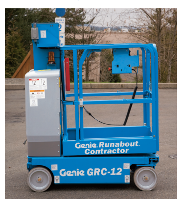
GRC Rigid Steel Platform Strong steel platform with standard extension deck offers an extra 17.5 inch outreach