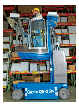
Stock Picker<sup>™</sup> Platform 35 x 28.5 in (89 x 73 cm) Offers dual side entry gates and front-folding tray.