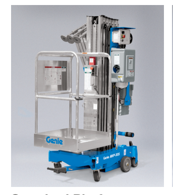
Standard Platform With Sliding Midrail 27 x 26 in (69 x 66 cm) An excellent general-