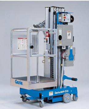
Gated Standard Platform 27 x 26 in (69 x 66 cm) Provides "step in" entry.