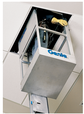
Narrow Platform The narrow platform option is perfect for accessing the space above ceiling tiles.