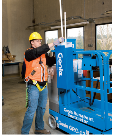
Fluorescent Tube Caddy (only available on narrow or standard platform)