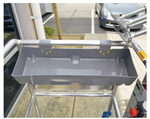
Work Station Tray (not available on narrow or ultra-narrow platforms)