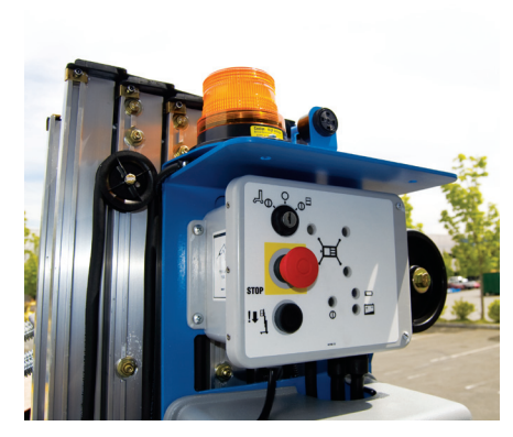
Operational Warning Light