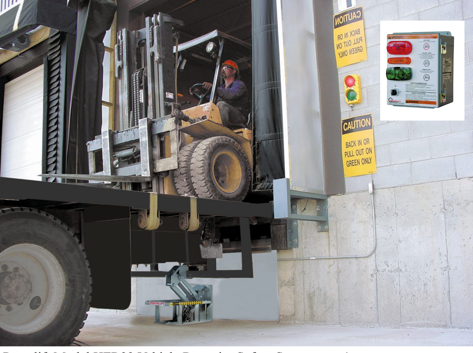
Pentalift Model HFR32 Vehicle Restraint Safety System Creates a safe, efficient and productive loading dock environment